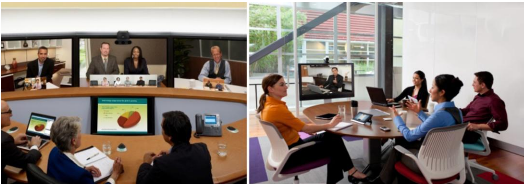
Figure 1. From the boardroom to the desk top, Cisco TelePresence powers the new way of working, where everyone, everywhere can be more productive through face-to-face collaboration.

As a part of the Cisco® Collaboration portfolio, Cisco TelePresence systems connect co-workers and extend collaboration to partners and suppliers. Cisco TelePresence technology meets the needs of teams and individuals and offers applications specific to each business; it is even accessible through public facilities.